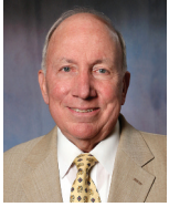
Mayor Don Ryan